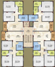
TYPICAL FLOOR PLAN (1ST TO 4TH) BLOCK 3, 4, 5 & 6